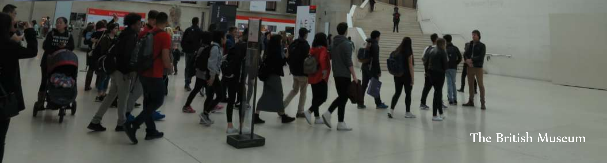
The British Museum