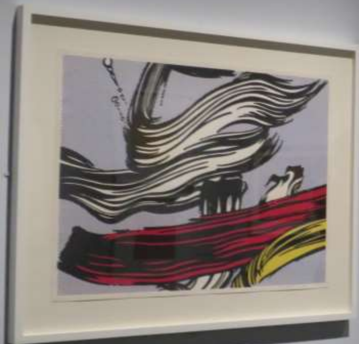
Abstract painting by [Artist Name] [Additional text]