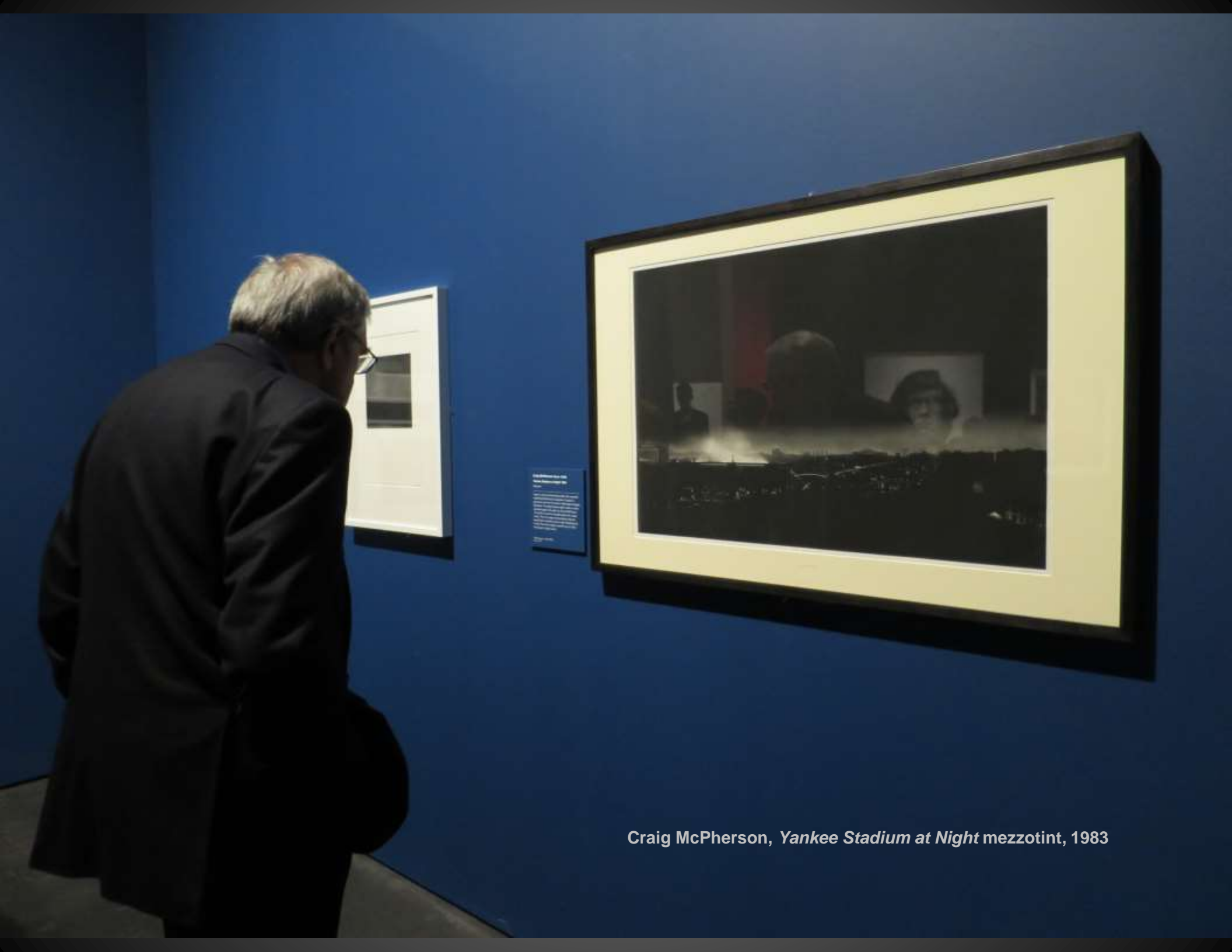
Craig McPherson, Yankee Stadium at Night mezzotint, 1983